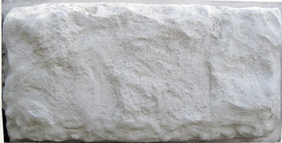
Mid-Size Original Face